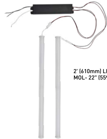
2' (610mm) LED Lightbar MOL- 22" (559mm)

The UR Series upgrade kit ships as two components: lightbars and driver. Each component must be ordered separately