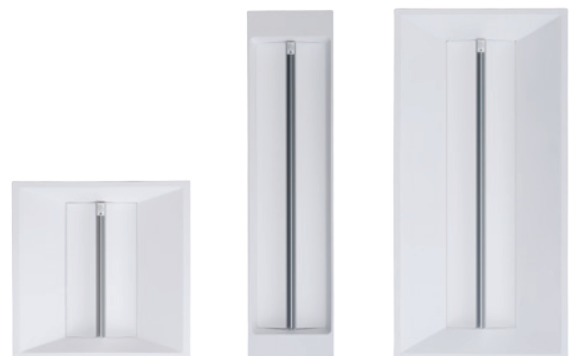
CR22™ LED troffer with Cree SmartCast® Technology

Doctors and nurses must have clear, bright light with superior color rendering for accurate patient assessment. Cree LED lighting promotes better visibility in diagnostic and clinical areas, enabling staff to perform more accurate evaluations and provide more efficient treatment.