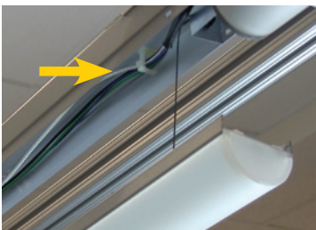
Simplified wire management