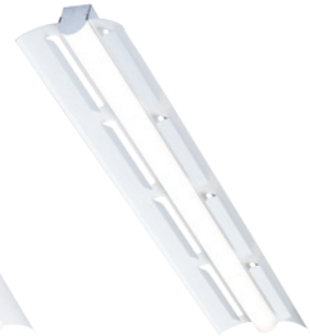
LED Surface Ambient Luminaire with Apertured Reflectors: • LS4-AR 4-foot • LS8-AR 8-foot • LS4-C 4-foot • LS8-C 8-foot