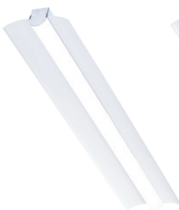
LED Surface Ambient Luminaire with Solid Reflectors: • LS4-SR 4-foot • LS8-SR 8-foot • LS4-C 4-foot • LS8-C 8-foot